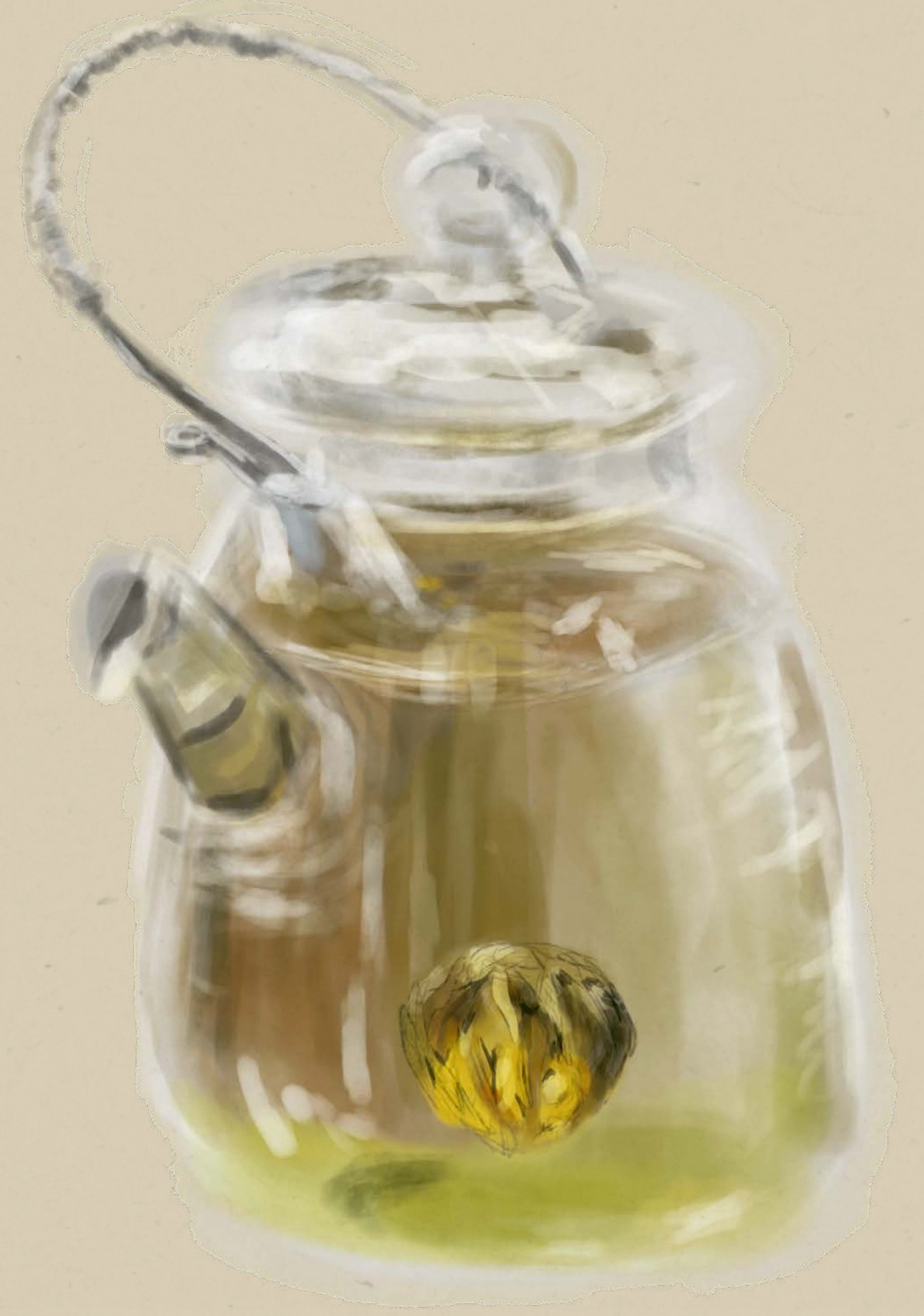
An exploration of femininity & tea